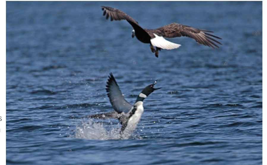
In a separate incident from the one described here, a loon launches out of the water to scare off a bald eagle on Bow Lake in Northwood, New Hampshire.

Now, hungry bald eagles are targeting loon chicks and even adults for a quick meal, she said.