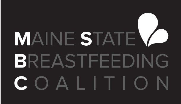
Black and White