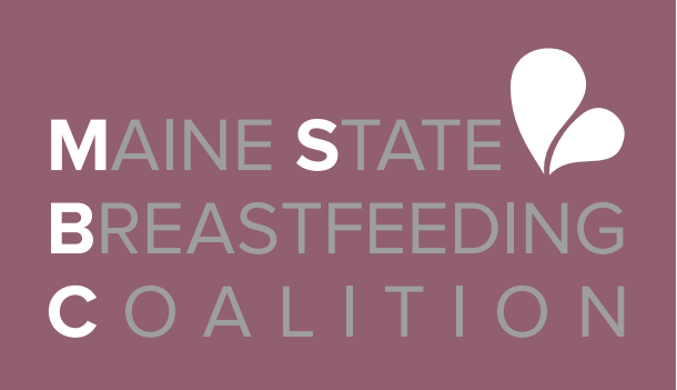
Mauve 1 background