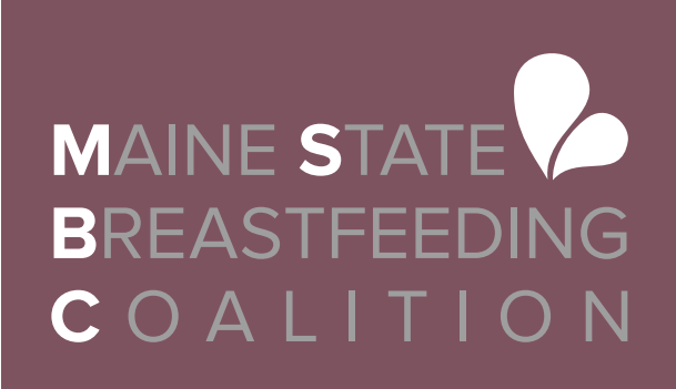
Mauve 2 background