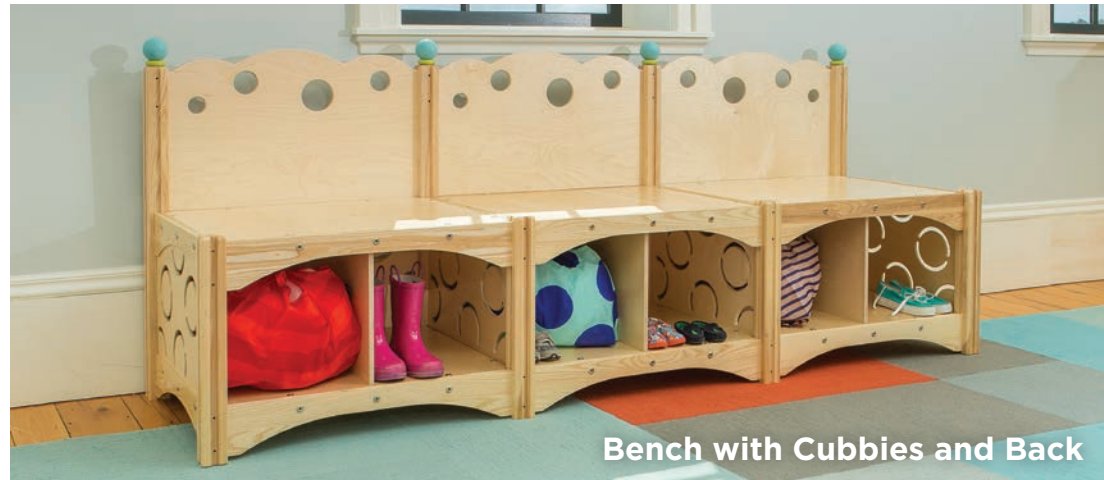
Bench with Cubbies and Back

Our modular bench design means you can size your bench to fit your needs. Start with a single unit bench that fits in a corner or expand infinitely to fit even the biggest space. You can also choose a simple bench style or add cubbies underneath or fences above.