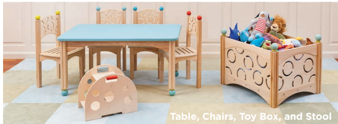
Table, Chairs, Toy Box, and Stool